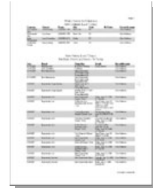
What's New Report